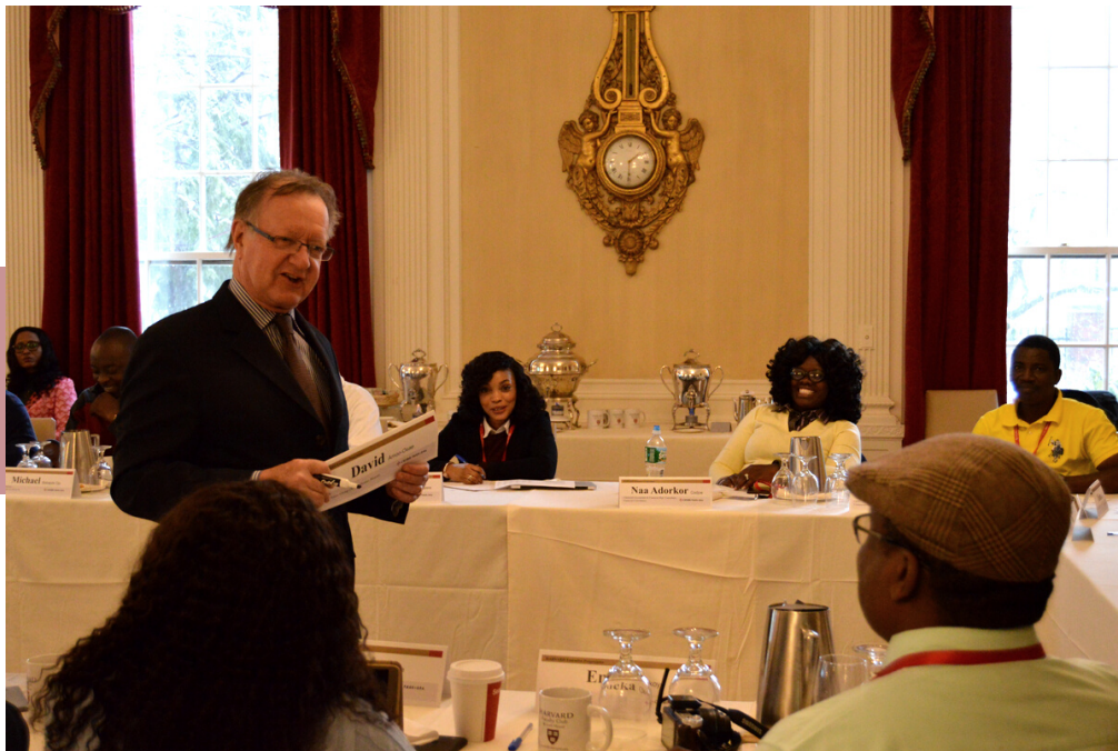
RCC at Harvard Executive Program In Company With CEIBS Africa Program, 2017, Harvard

Do you want to live the Harvard experience with all your team? Do you want your company to work together with other executives and entrepreneurs in the unique environment of Cambridge?