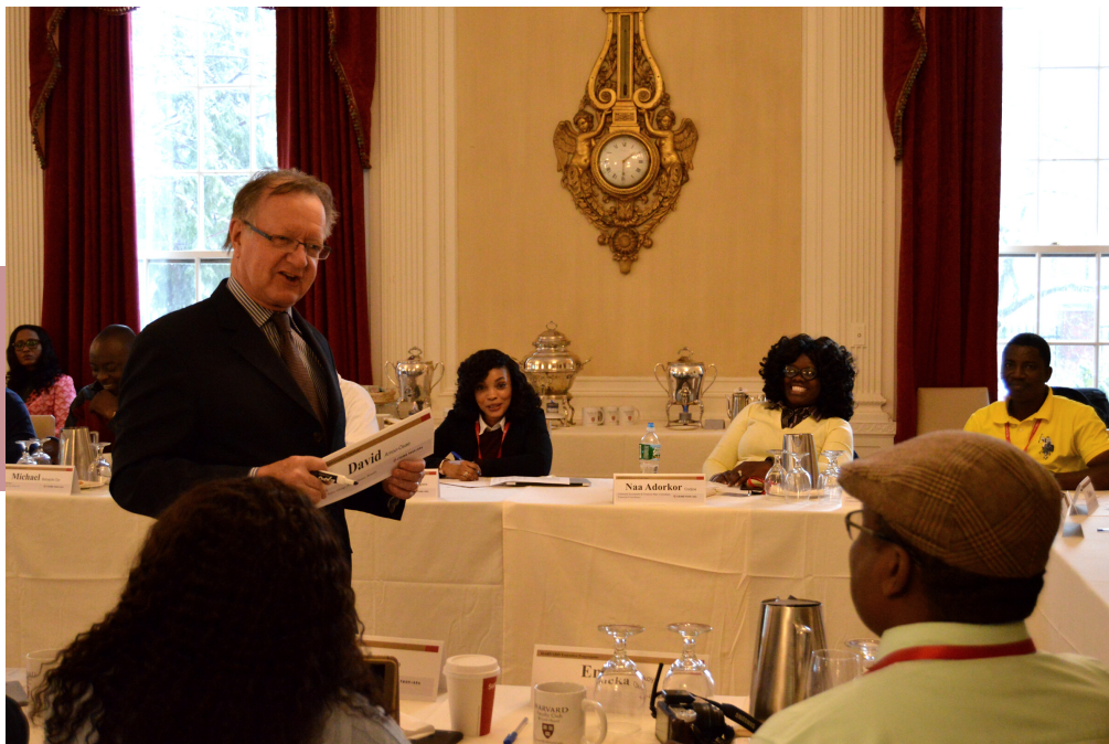
RCC at Harvard Executive Program In Company With CEIBS Africa Program, 2017, Harvard

Do you want to live the Harvard experience with all your team? Do you want your company to work together with other executives and entrepreneurs in the unique environment of Cambridge?